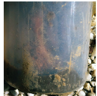
DO NOT replace