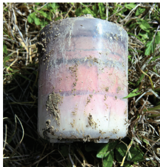
DO NOT replace unless integrity is compromised