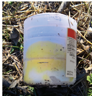
DO NOT replace