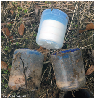
New vs. consumed (replace only consumed)